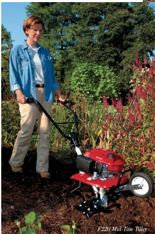
F220 Mid-Tine Tiller

Standard on Honda Tillers, this feature makes quick and easy starting a sure thing, every time.