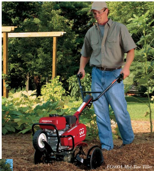
FC600A Mid-Tine Tiller

The operator-friendly handle adjusts to offer a comfortable operating height no matter how tall you are.